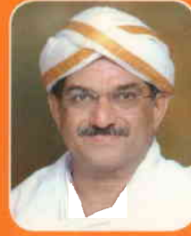
Dr. D. Veerendra Heggade Chairman