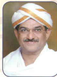
Chairman Rajashri Dr. D. Veerendra Heggade Dharmadhikari of Sri Kshetra Dharmasthala